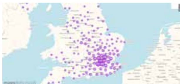
Figure 2: Termtime addresses of students at a London institution

KUL has undertaken significant analysis of its commuter student population 18 , this includes a map showing the density of the KUL student population in each of the postcode areas around the University 19 . Additional functions have also been developed allowing staff to explore specific features of the commuter student population (e.g. first in family, ethnicity and disability) and to view more detailed information about the commuter students in specific postcode areas, including the number of students, the likely commute time, and student characteristics.