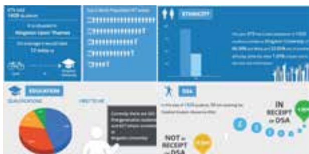
Figure 4: Additional infographics about Kingston University's commuter student population in one postcode area

Further data analysis would be useful both across the sector and within institutions to understand the intersectionality of 'being a commuter student' with other characteristics, such as (as illustrated in the Kingston infographics above and below), in particular: socio-economic status, ethnicity, age, gender, disability, entry qualifications and tariff points, subject studied, institution attended, (this list is informed by the analysis by Artess et al 2014 and HEFCE 2009, cited above).